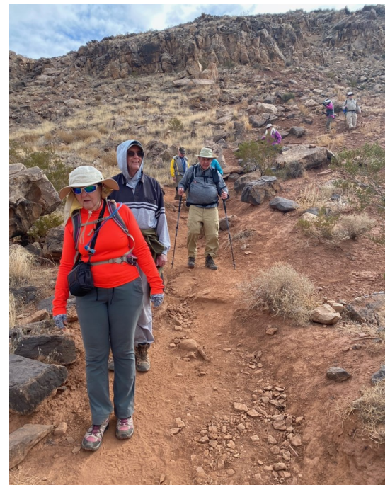
ICL Hiking Club on a January hike