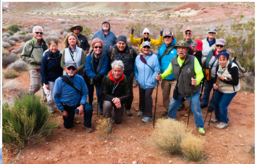
Desert Archaeology Club, February trip to Historic Babylon