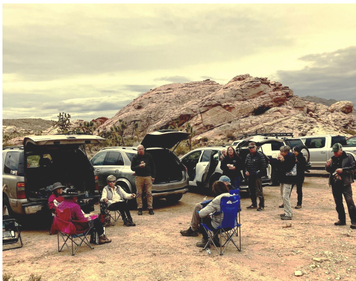
Picnic after Botany Field Trip to Gold Butte led by Lee Hughes