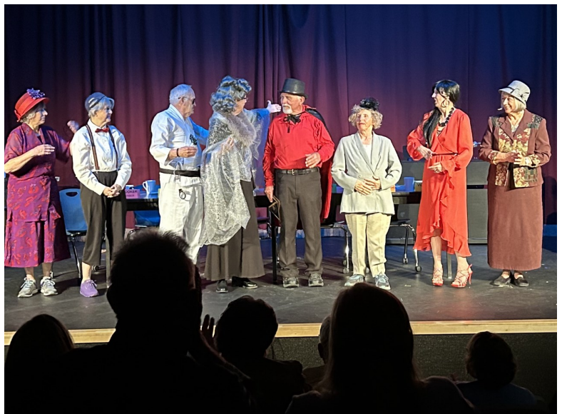
The ICL Players take a bow after performing the melodrama.