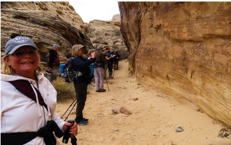
Desert Archaeology Club - January trip to Khota Circus petroglyphs